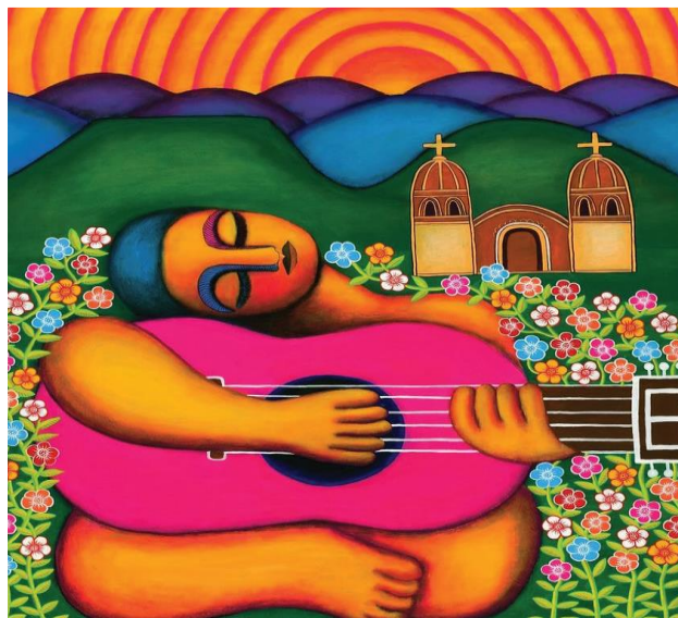
Obra de arte por Santiago Savi

Para interpretación ASL, favor escribir a deafcatholic@adw.org con dos semanas de antelación.