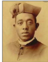
Venerable Augustus Tolton

Last year, CCW-ADW supported the Tolton Ambassadors-DC to promote the cause for Sainthood of the first acknowledged black priest in the US. https://sites.google.com/view/toltonambassadorsdc/home