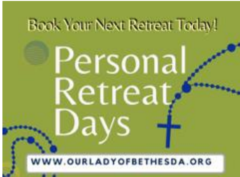
Personal "Retreat" Day (9 a.m. – 4 p.m.)

Visit www.ourladyofbethesda.org or call 301-365-0212. Our Lady of Bethesda Retreat Center, 7007 Bradley Blvd., Bethesda, MD 20817.