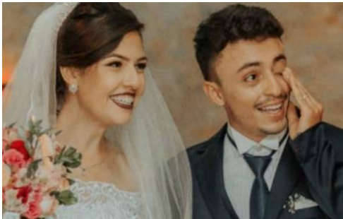
Three to Get Married Marriage Prep

Are your days overcrowded, jam-packed, and busy, busy, busy? Take a break and enjoy your very own personal retreat at Our Lady of Bethesda Retreat Center. During your personal retreat, from 9am-4pm, an experienced retreat director will guide you to a place of rest with Christ. The retreat schedule allows for one-on-one spiritual direction (optional), quiet reflection, Mass, Confession and Eucharistic Adoration, plus lunch; so, you will be nourished and cared for while Our Lord speaks to your soul about the depths of His love for you. The cost is $100 per person. Advance Registration is required.